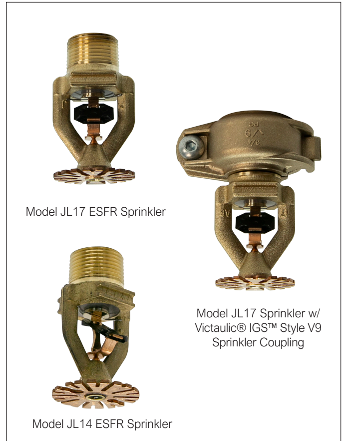
Models JL14 & JL17 ESFR Pendent Sprinklers

*Note: Victaulic® and IGS™ are trademarks of Victaulic Company.